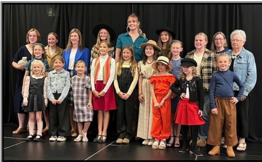
2024 SD MIWW Contestants

State entry fee of $10 per entry for QAN and the 2025 Challenge Contest.